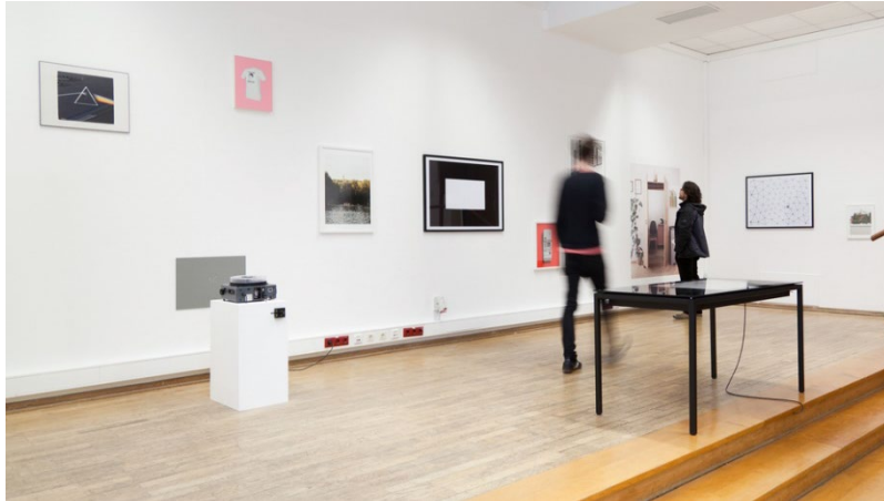
Design and Art