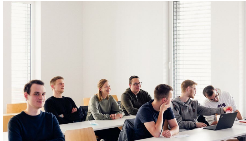
Bielefeld School of Business